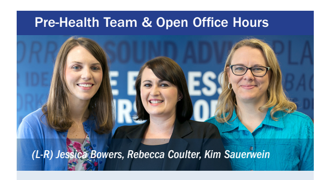
Monday - Thursday, 1:30 pm - 4:30 pm Gilmer 290D

• Interviewing for Health Professions Admissions